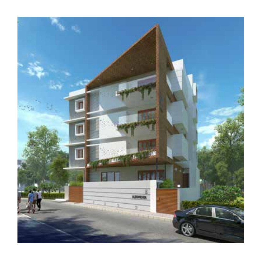
\Lambda L E X A \Pi D R I \Lambda